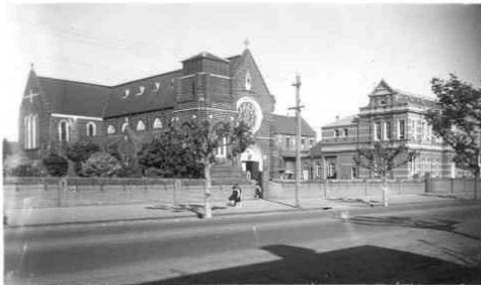
THE WIDE SERIES P. 12119 ST. PETER & PAUL R.C. CHURCH & SCHOOL, ST. PETER PARK, V.C.